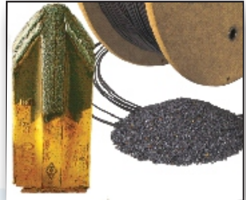
Bucket tooth gets new life with MIG TUNGSTEN CARBIDE.

Typical equipment that can benefit from MIG Carbiding are mining and construction equipment, dredging equipment, mixing, blending, shredding and processing equipment, drill bit and equipment, agricultural parts.